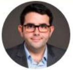
Issa Aghabi Venture Capital, IFC, UAE